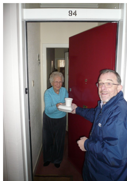
Our Delivery Volunteers