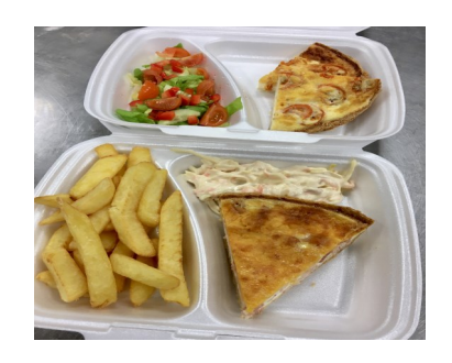
Quiche and chips or salad