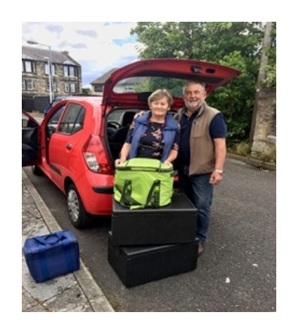
Our Delivery Volunteers