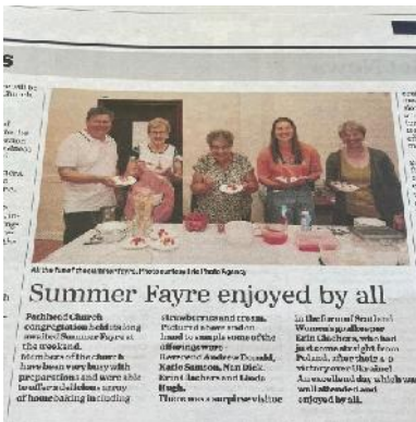
We even hit the local press!!