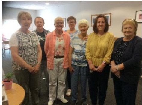
Tea Team ready for action!

In May the Kirk Session took the decision that we could once again hold a Summer Fair, the first since 2019! After everything that people have gone through over the past few years, we were unsure what the response would be and we were also aware that there was not going to be a great deal of time to prepare and advertise. Stall holders rallied round and before we knew it Saturday 25 th June had arrived. The fair was quieter than past years but it was great to see people turning up to browse and buy. As usual, the teas proved to be very popular!