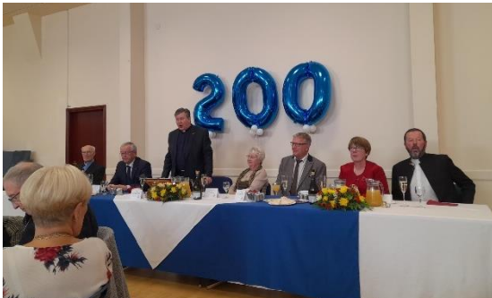
The top table