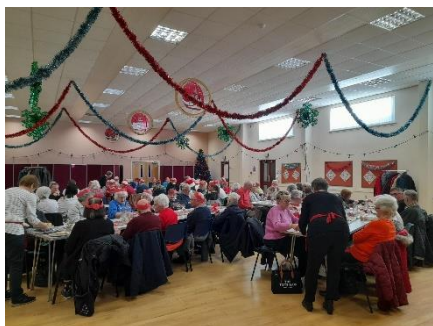
Almost 70 people enjoyed a Christmas Meal

The final total raised was £2981.90 which will be used to help maintain the fabric of the church and halls.