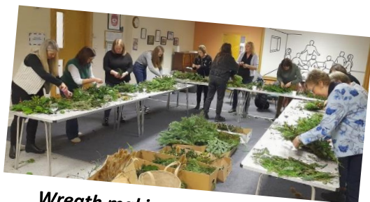
Wreath making workshop